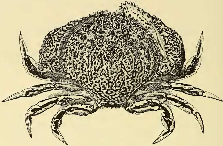
FIG. 1. Cycloes deweti , male holotype, \times 0.56 .

not separated; branchial region irregularly ridged by five longitudinally curved furrows subparallel to anterolateral margin; surface otherwise slightly uneven, with several obscure elevations surmounted by clusters of granules. Frontal projections (Fig. 2 a ) blunt and elongate, lateral margins oblique, mesial margins subparallel, thereby forming distinctly U-shaped median sinus. Dorsal margin of orbit sharply separated by subrectangular bend from frontal margin, with distinct short fissure slightly lateral to mid-width. Anterolateral margin bearing three or four enlarged compound teeth in anterior half of length; posterior portion rather uniformly dentate, but three or four regularly spaced teeth slightly more upstanding than others. Lateral tooth prominent, sharp, and directed dorsolaterally.